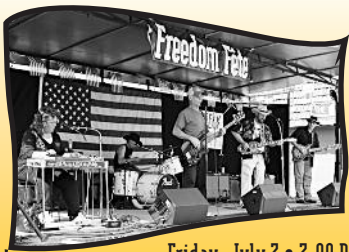
Friday, July 3 • 3:00 PM "Redneck Country"