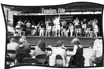
Friday, July 3 • 12:30 PM "Mesabi East Jazz Band"