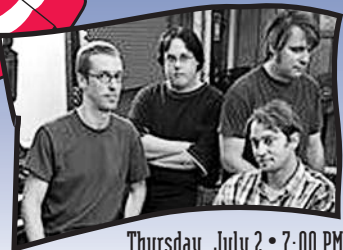
Thursday, July 2 • 7:00 PM "The Tisdales"