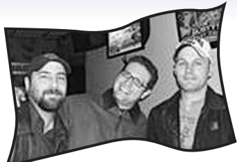
Thursday, July 2 • 9:30 PM "Mellowdrama"