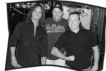
Friday, July 3 • 8:15 PM "Payback"