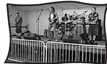
Friday, July 3 • 10:20 PM "Bottomline"