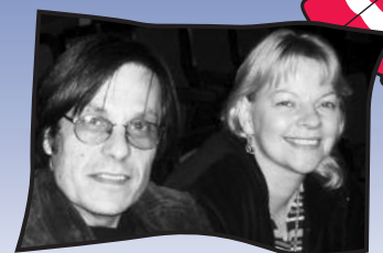
Friday, July 3 • 7:00 PM "BitterSweet"

Souvenirs ★ Patriotic Novelties ★ Flags & more